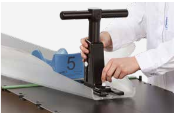
Art. N° 29115