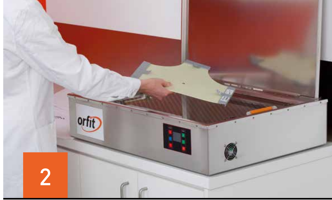
2 Place the precut mask in the hot water.