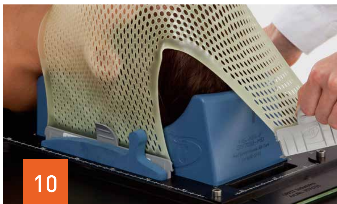
10 To secure the profile, slide the L-shaped profile into the slot.