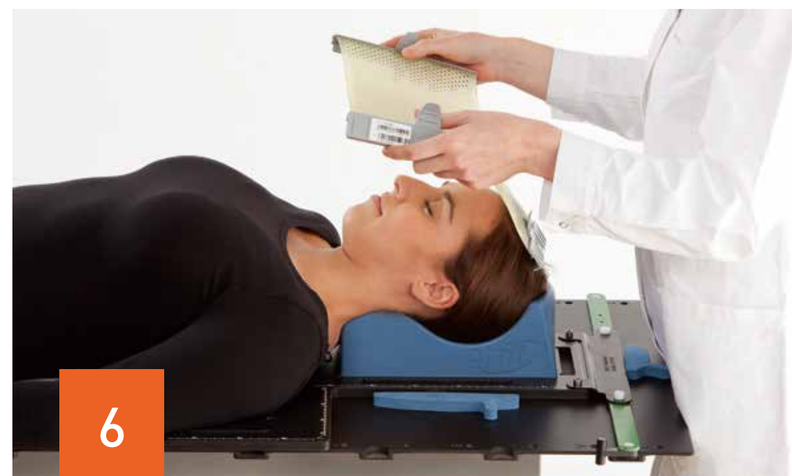
6 Pre-stretch the mask slightly before positioning it on the patient.