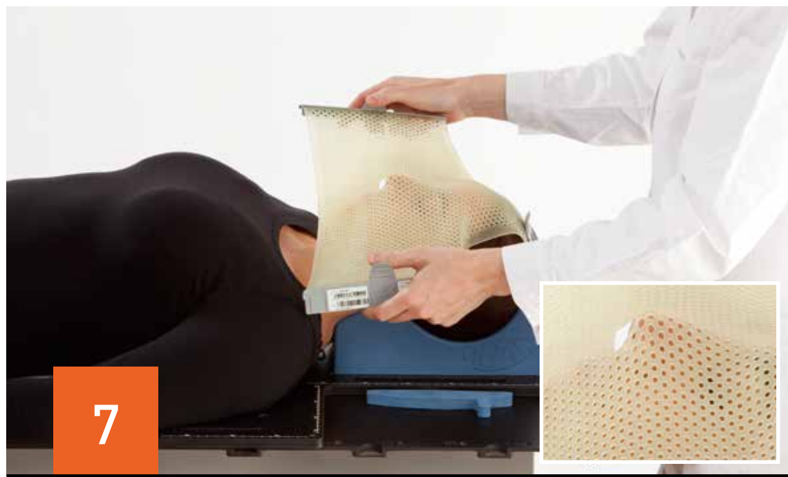
7 Position the precut over the face of the patient with the top of the nose hole on the tip of the nose.