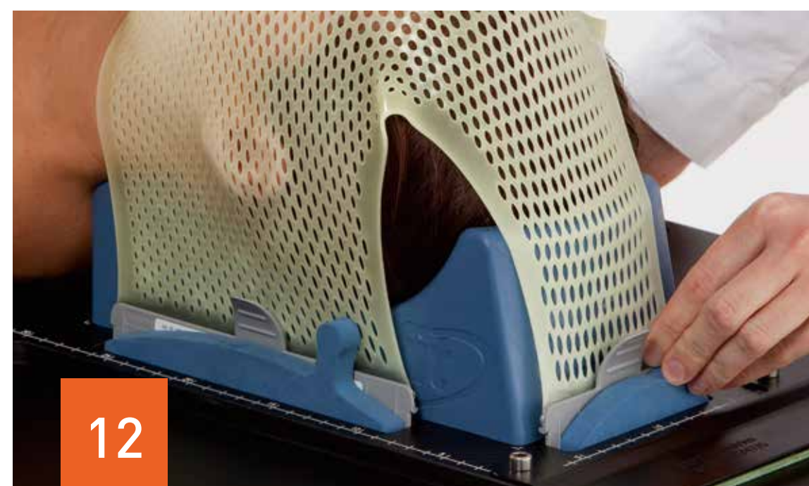
12 Secure the L-shaped profile in the slot with a foam handle of the appropriate length.