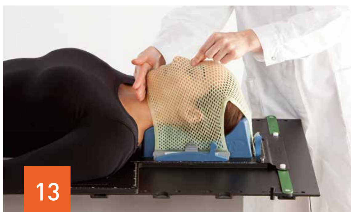
13 Mold the mask only around the chin and the bony part of the nose. Do not mold over the forehead and the cheeks to prevent a mask that is too tight.