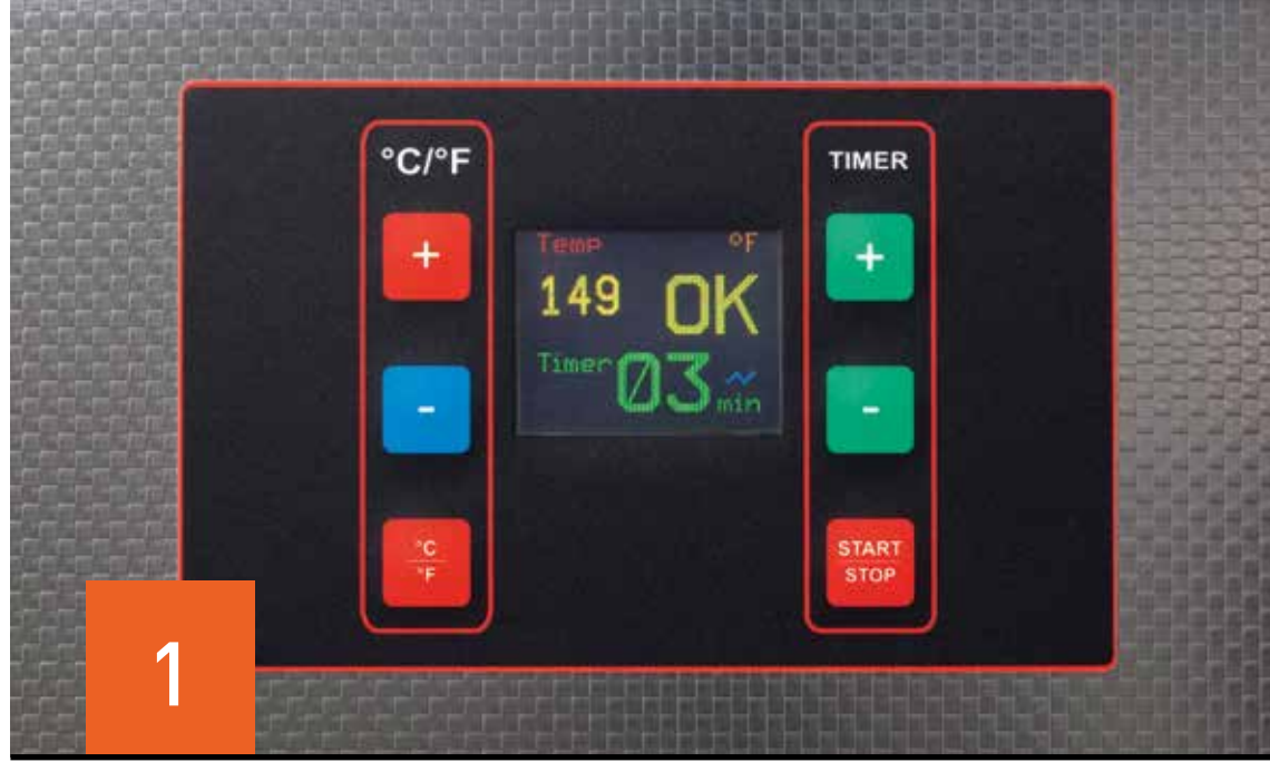
1 Make sure that the temperature of the water bath is between 149°F and 158°F (65°C and 70°C).