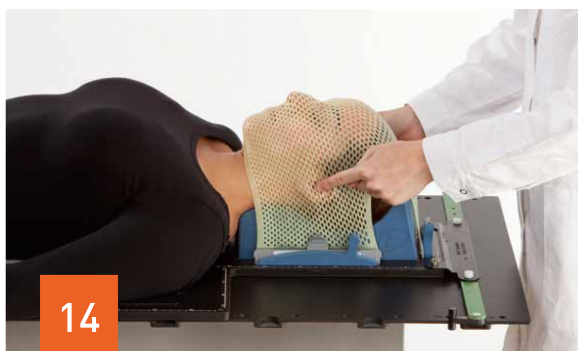
14 Push the mask slightly into the ears to serve as reference points for the patient.