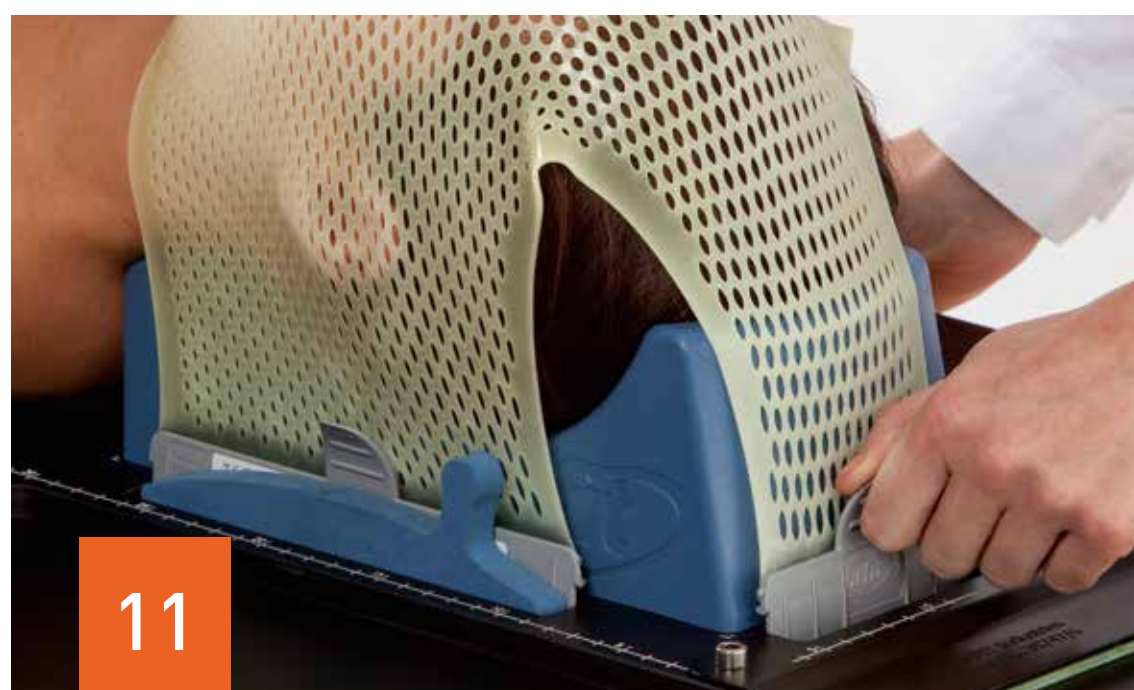
11 Push the L-shaped profile all the way into the slot.