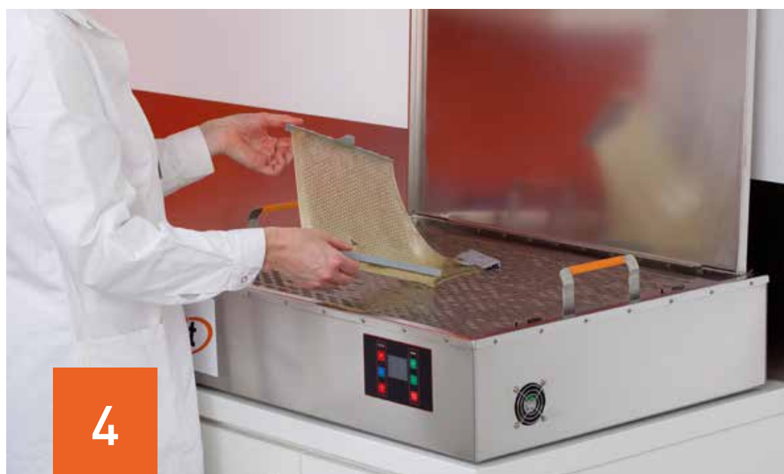
4 Remove the precut mask from the water bath.