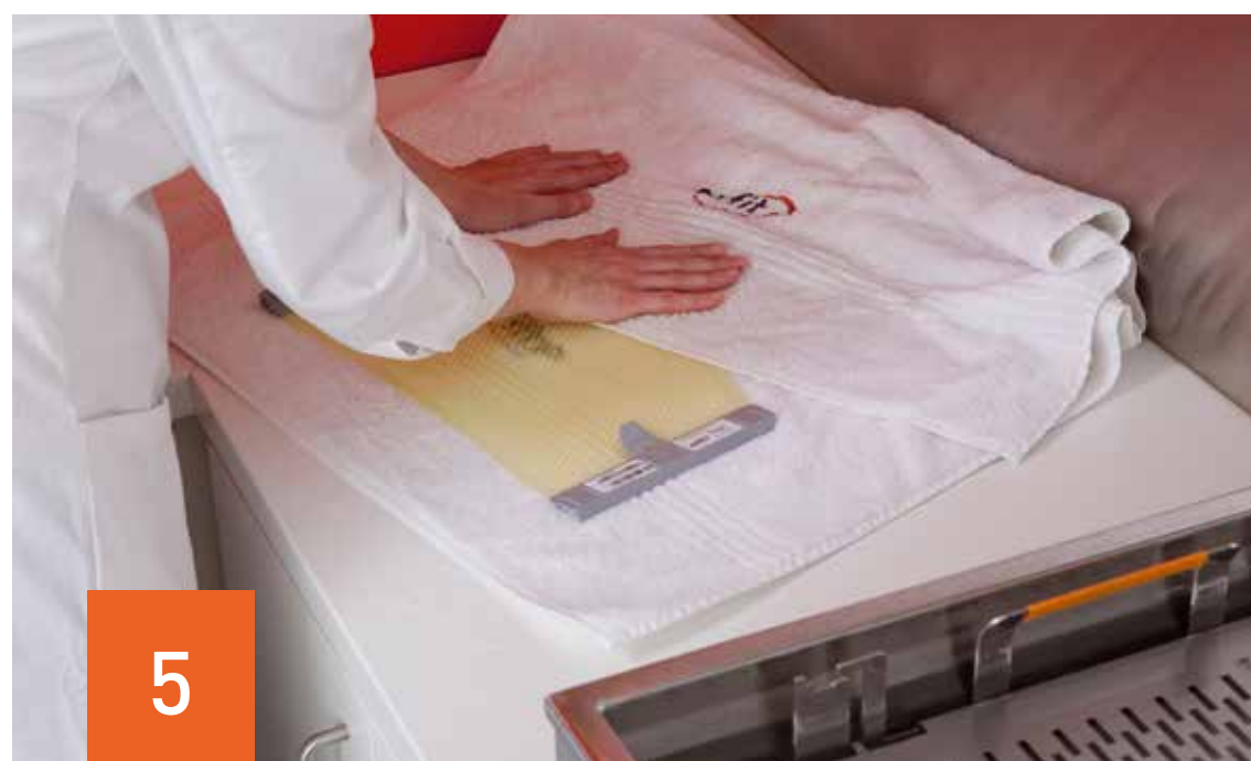
5 Remove excess water by dipping with a towel.