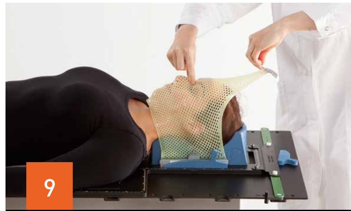
9 Hold the material at the nose and stretch the cranial flap. Secure the L-shaped profile in the base plate.